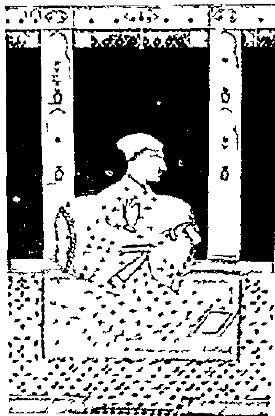
Goswami Sri Parushottamji See Page 345